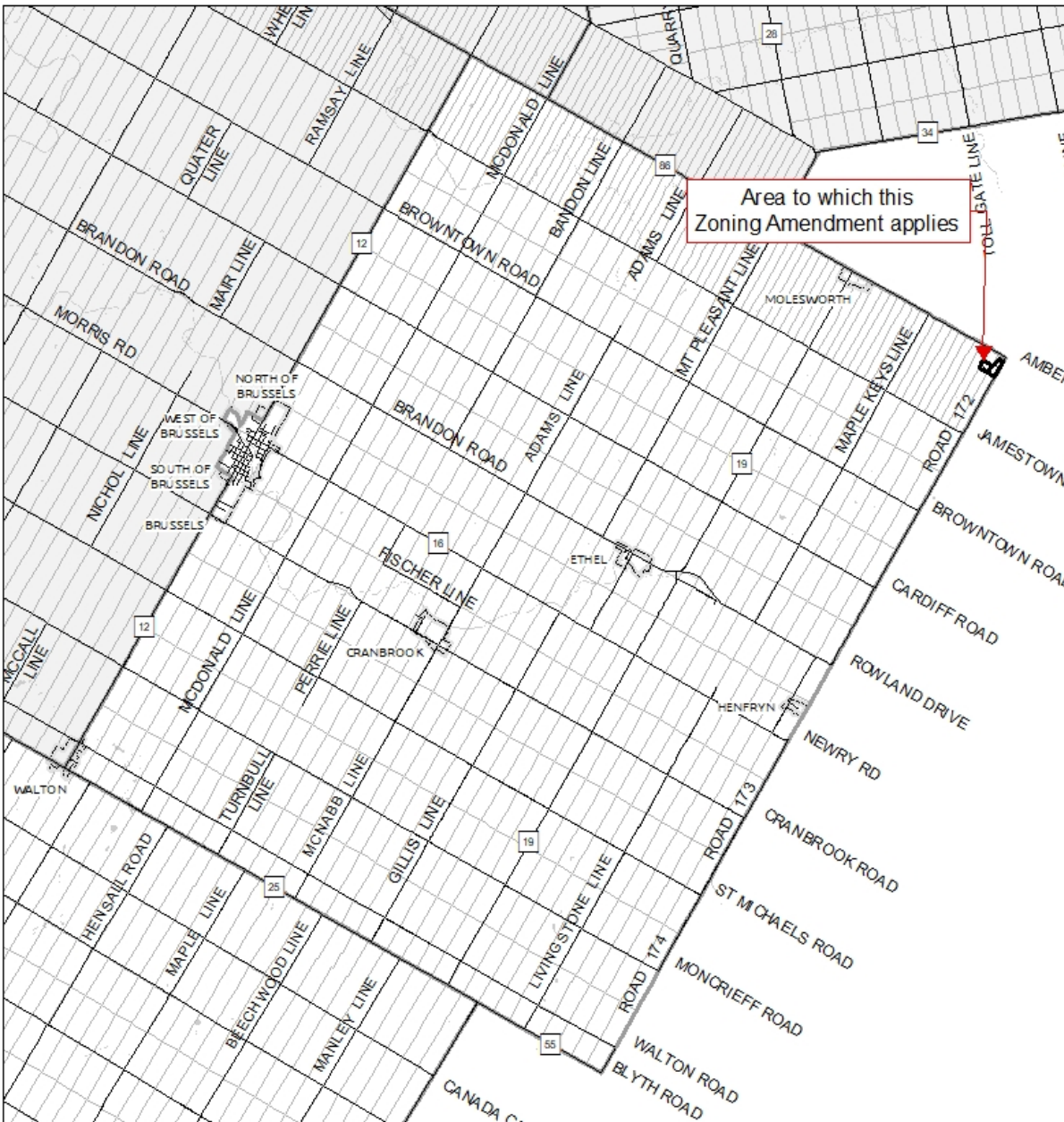
Municipality of Huron East Location Map Grey Ward