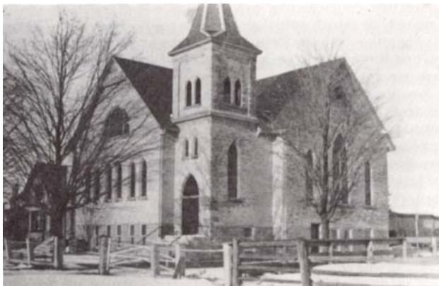
Brucefield Church built in 1908, burned 1970.

Instead of renovating the existing church, the decision was taken to build a new church. Using some of the brick from the old church, the new church was built in 1908. Fire destroyed this church in 1970, but it was soon replaced by the present church in 1972.